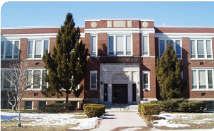
Brockville Collegiate Institute (BCI) offers the International Baccalaureate Program for students with high level English language.

The IB Diploma program students requires students to study English, math, science, social science, the arts and theory of knowledge. Students enrolled in the IB program also commit to 150 hours of activity divided among volunteer service, sports and the arts.